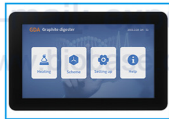
Touch screen operation

GDA-30 has the advantages of fast digestion, high efficiency, convenience and large processing capacity. It is an ideal pre-treatment equipment for atomic absorption spectroscopy, ICP mass spectrometry and other elemental analysis instruments.