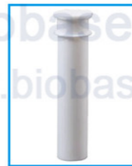
PTFE Digestive Tube